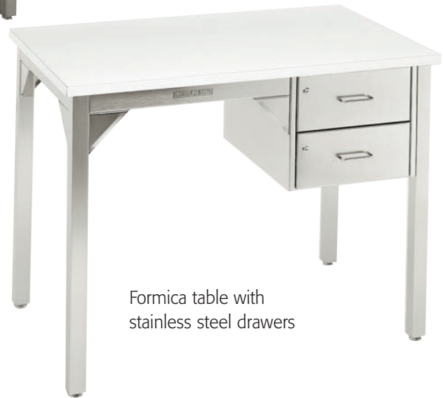
Formica table with stainless steel drawers